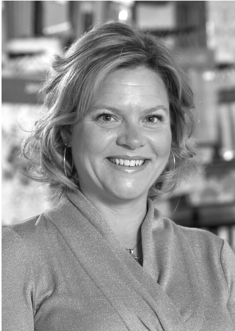
Shannon Conley Interior Design